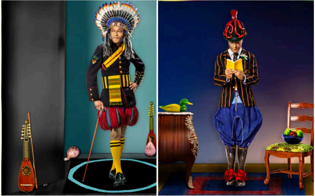
Iké Udé on show at Leila Heller Gallery from October 10 to November 10