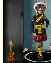
Iké Udé Sartorial Anarchy #29, 2013